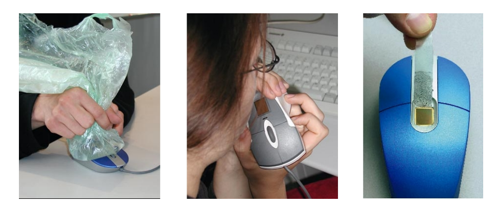
Figure 4: The three pictures from the article [TKZ02] show three different methods how it is possible to fool a fingerprint scanner.

The following points describe three methods which were used to successfully trick the face recognition tool: