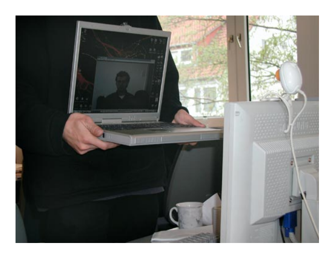
Figure 5: A face recognition is fooled by presenting the camera a simple picture of an authorised user on a laptop. [TKZ02]

The tests described in this article show clearly that the tools tested are not very secure and most of them can be tricked quite easily by non experts. By now the vendors of such products might have been able to improve them, but a risk always remains. So this paper and most of the other referenced papers conclude that biometric data should not yet be used on its own in an authentication process. A more secure authentication process could combine biometrics with other technologies. For example password and fingerprint or smart card and fingerprint.